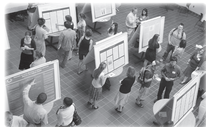
3rd Annual Undergraduate Research Forum