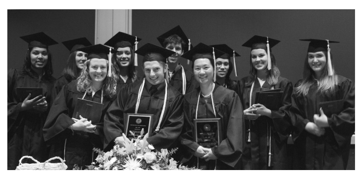
2007 Honors Progrram Award Winners

fully completed their theses and were honored at our annual graduation celebration on April 27th. The previous week these students, along with other seniors who had completed significant independent research projects, presented posters about their research at the second annual Undergraduate Research Forum. The event drew students and faculty from across the department for a festive afternoon. The stories of two such students are described below.