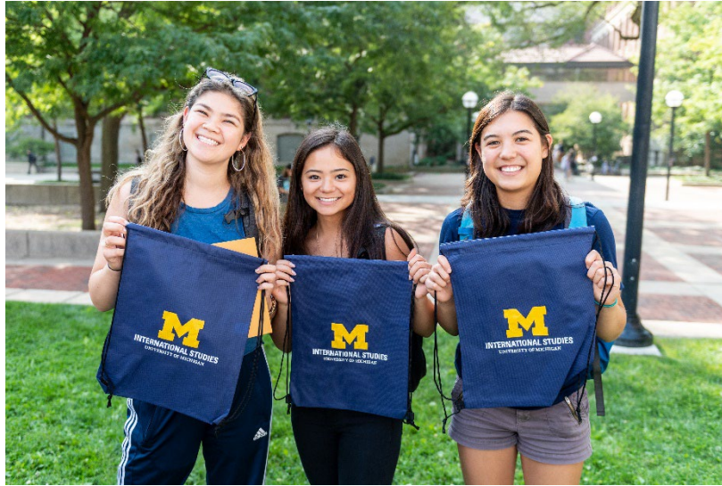
International Studies students at the fall Welcome Back PICS Students event.

Please note that only the PICS director can approve courses used towards the sub-plan requirement that are not already found on the pre-approved list. Students sometimes find courses that are suitable for their programs and can petition to have them approved by filling out the online PICS Course Approval Form . (Login with Kerberos username and password).