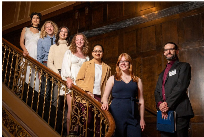
2023 International Studies Honors Plan student cohort at the PICS Graduation Ceremony.

The Program in International and Comparative Studies (PICS) offers an Honors Plan for International Studies majors with an overall GPA of 3.4 and with a grade of B+ or better in INTLSTD 101. Students elect INTLSTD 498 in the fall and INTLSTD 499 in the winter (the senior Honors proseminars) during their senior year and write a major research paper under the direction of a faculty advisor and the instructor of INTLSTD 498-499.