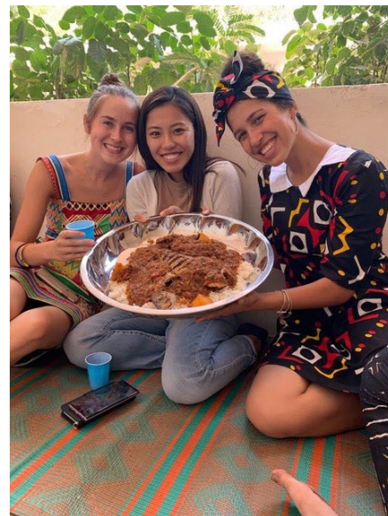
A PICS student while studying abroad in Dakar.

Political Economy of Long-Run Development Theory and Practice of Human Rights Concepts in Global Health