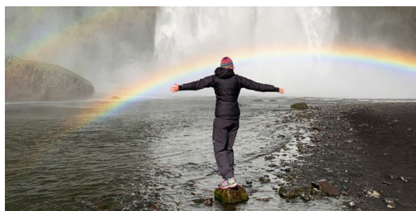
International Studies student on a PICS funded internship in the Arctic.

International studies advisors are available to meet with undeclared students who would like to learn more about the program, and also with current majors and minors who would like to discuss course selection, major or minor requirements, senior releases, and other matters of concern. Advising appointments are available In Person , Phone , and/or Virtual formats. Please make your advising appointment by using the online advising appointment system .