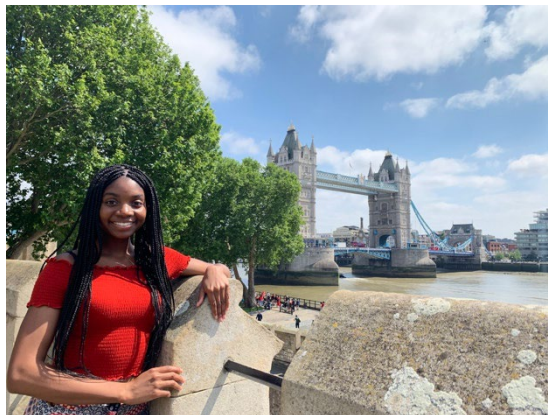
Above: International Studies students studying abroad in France. Left: International Studies student studying abroad in in London.