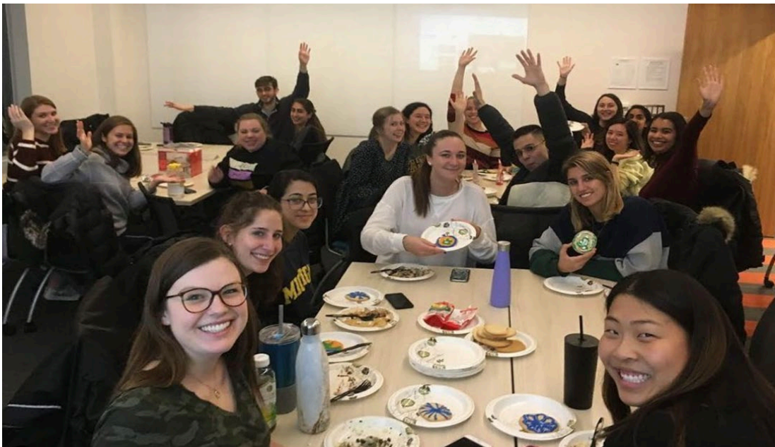
2019-2020 Sigma Iota Rho members at a meeting with cookie decorating.

Although studying abroad is not mandatory, it is highly encouraged. A cross-cultural experience broadens your perspective and helps you develop skills that are sought out by future employers. Students should visit the Center for Global and Intercultural Studies (CGIS) , U-M's study abroad office, to learn more about study abroad program opportunities. PICS offers some limited funding to International Studies majors that study, intern, or conduct research abroad. For more information about this please go to Funding Opportunities, pg. 16.