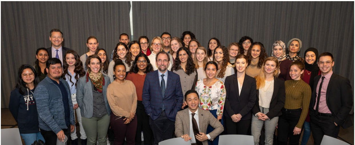
International Studies students and Public Policy students with United Nations High Commissioner for Human Rights (2014-18) Zeid Ra'ad Al Hussein

A: The only restriction is that you may not apply 100-level courses toward the satisfaction of your elective requirements.