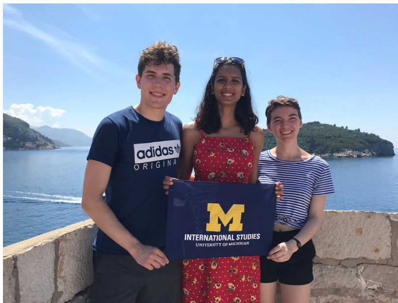
International Studies student on a study abroad experience in Albania.

PICS also administers the Arctic Internship Fellowship which is open to all University of Michigan undergraduate students, and the International Human Rights Fellowship which is specifically open to all LSA undergraduate students. PICS keeps track of other various internship, research, and funding opportunities in and related to international issues on the PICS announcement blog . PICS is also a part of the International Institute which provides several additional funding opportunities to undergraduate students, including those from the Donia Human Rights Center .