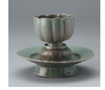
12th Century Korean Stoneware Stirrup Cup