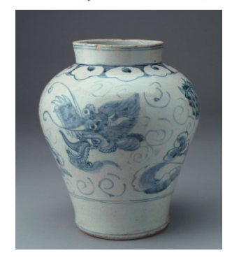
18th Century Korean Porcelain Jar