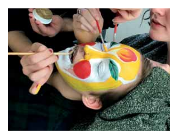
Outreach activity on the artistry of painted faces as seen in Chinese opera performance and interpreted by students.

Programming includes educator workshops offered through the World History and Literary Initiative (WHaLi) and East Asia K-12 Teacher Workshops; collaborations with the Midwest Institute for International/Intercultural Education (MIIIE), a consortium of 100 two-year colleges; language support at Washtenaw Community College (WCC); library travel grants for researchers and educators; the development of an East Asia Language Teacher Certification program in partnership with the U-M School of Education; support of teaching workshops through area studies experts for faculty and students at University of Puerto Rico (UPR); and professional development opportunities for masters students.