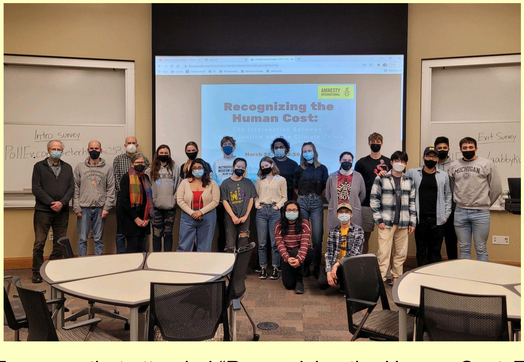
Everyone that attended "Recognizing the Human Cost: The Intersection Between Social Justice and the Climate Crisis!