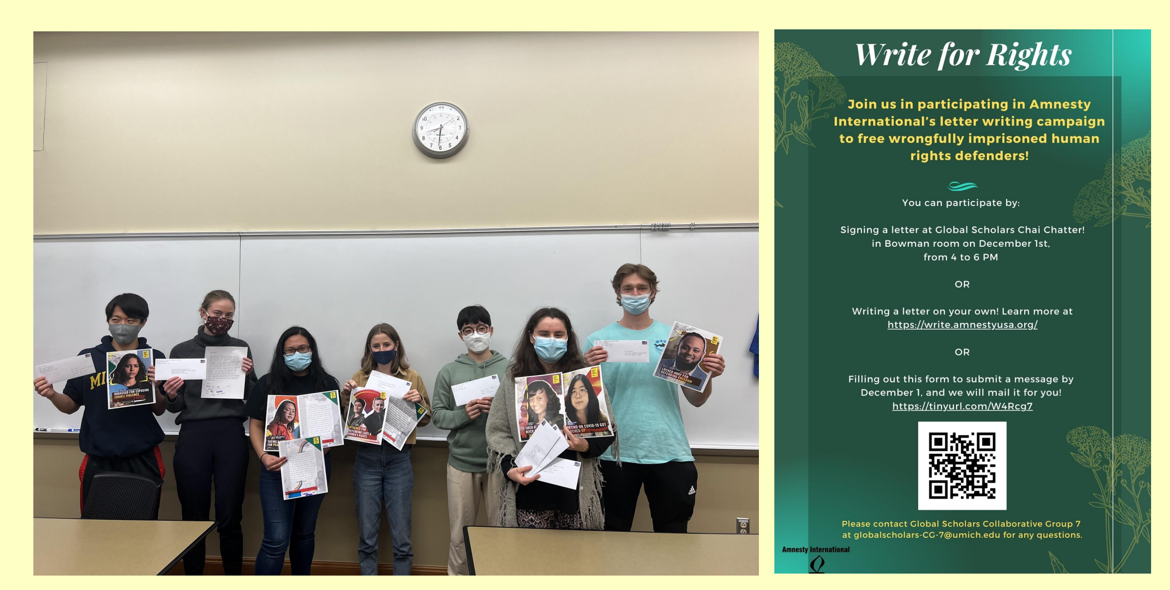
This is us with the letters we wrote for the Write for Rights campaign and a poster we created to promote it!