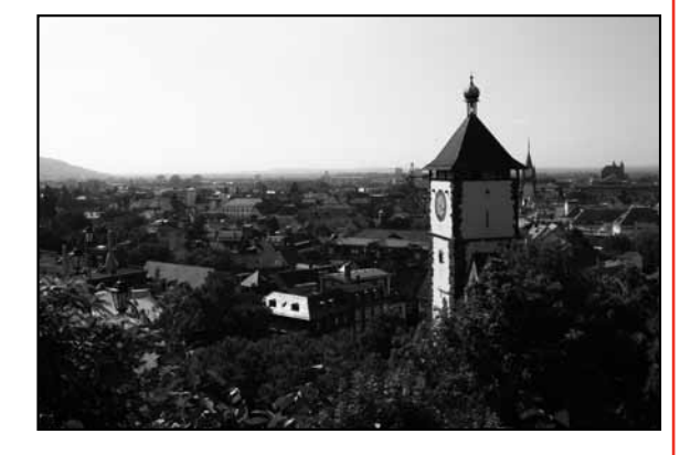
Two views of Freiburg

the 200th anniversary of Oktoberfest in München. Not really knowing what to expect, the hundreds of thousands of people at Oktoberfest was almost in comprehensible, however, singing "Sweet Caroline" in a Bierzelt with hundreds of others was truly a