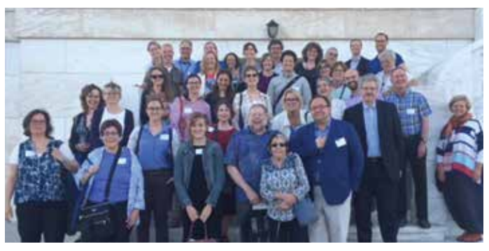
ICNS conference attendees at the Detroit Institue of Arts