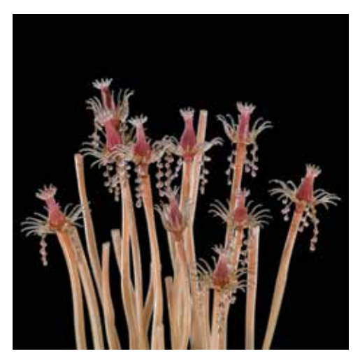
Tubularia indivisa (Nr. 191a), Leopold and Rudolf Blaschka, Dresden Germany, 1885.

As both students and faculty know all too well, U-M has a grueling schedule that keeps us incredibly busy virtually non-stop from September through April. While it can be particularly challenging for faculty to maintain and advance their research agendas during Fall and Winter semesters, the flip-side of all this is a comparatively long period of four uninterrupted months for research and writing in the summer. The considerable productivity of these periods is reflected in faculty publications, lectures,