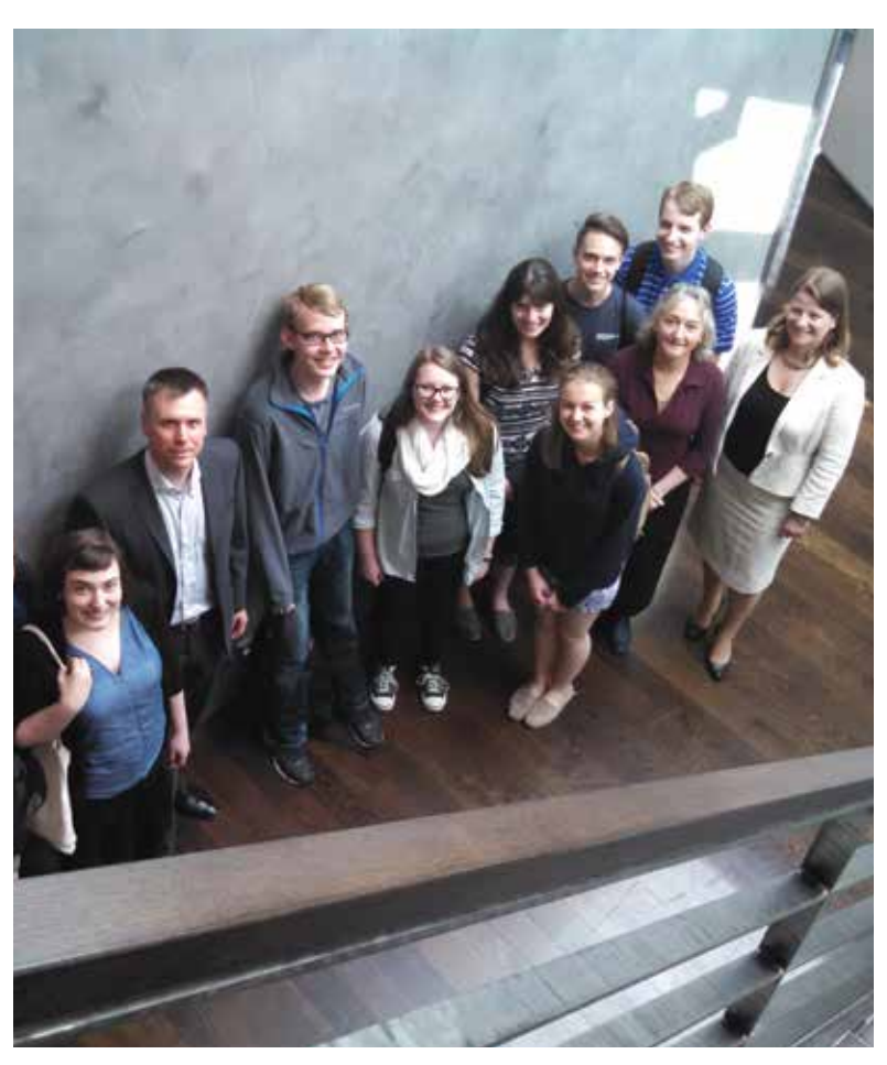
Max Kade Haus students visited the law firm Kirkland & Ellis while on their study tour to Munich in May