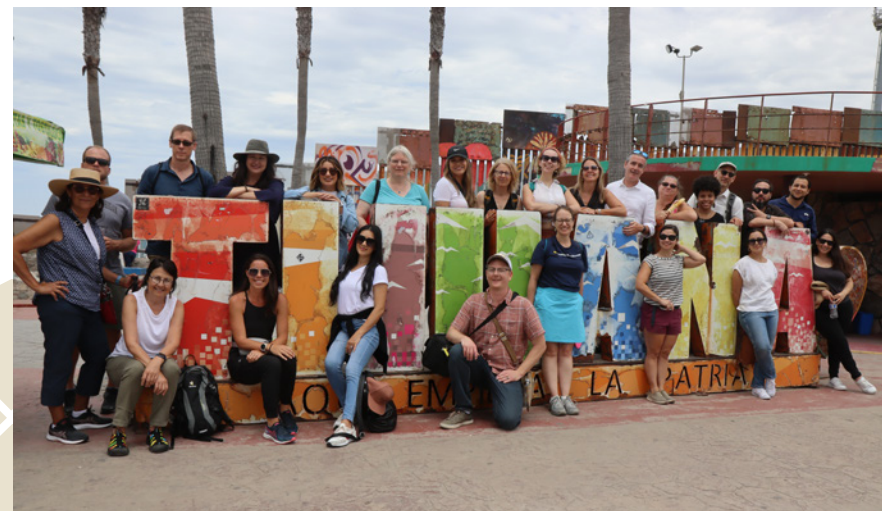
Teachers and workshop facilitators from California and Michigan gather at Friendship Park in Tijuana, Mexico.

GMEI is supported by a Title VI National Resource Center Grant from the U.S. Department of Education.