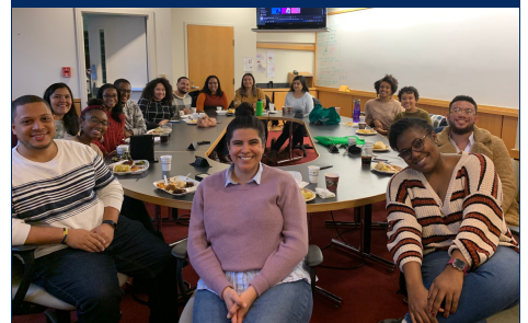
LSPA X BSPA Orgs-giving