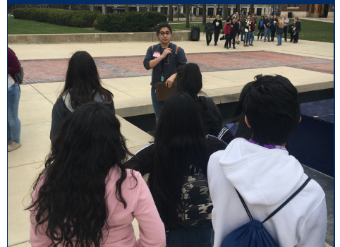
Pioneer High School College Day