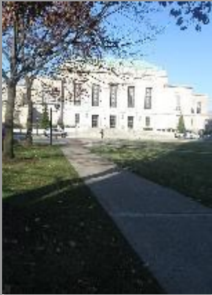
Rackham Graduate School

The Rackham Graduate School works with faculty, students and staff across the University of Michigan to promote excellence in graduate education for over 8,200 students in 108 Ph.D., 87 master's, and 34 certificate programs.