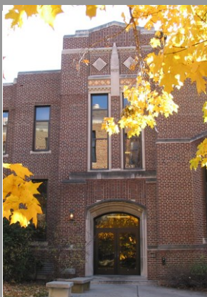
School of Education

The Rackham Graduate School works with faculty, students and staff across the University of Michigan to promote excellence in graduate education for over 8,200 students in 108 Ph.D., 87 master's, and 34 certificate programs.