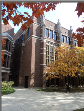
School of Education

The mission of the University of Michigan is to serve the people of Michigan and the world through preeminence in creating, communicating, preserving and applying knowledge, art, and academic values, and in developing leaders and citizens who will challenge the present and enrich the future.