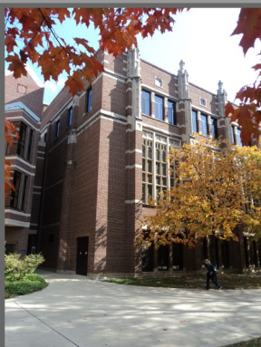
School of Education

The mission of the University of Michigan is to serve the people of Michigan and the world through preeminence in creating, communicating, preserving and applying knowledge, art, and academic values, and in developing leaders and citizens who will challenge the present and enrich the future.