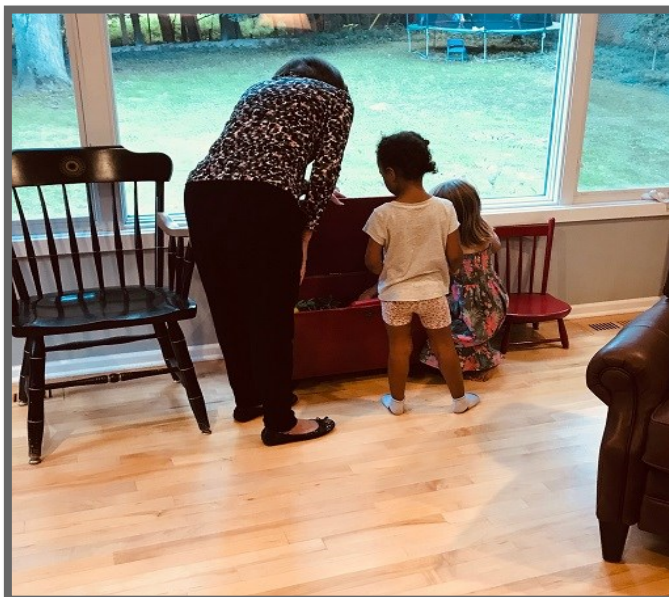
JPEE Welcome Back Dinner August 30, 2018