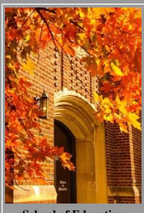
School of Education

The mission of the University of Michigan is to serve the people of Michigan and the world through preeminence in creating, communicating, preserving and applying knowledge, art, and academic values, and in developing leaders and citizens who will challenge the present and enrich the future.