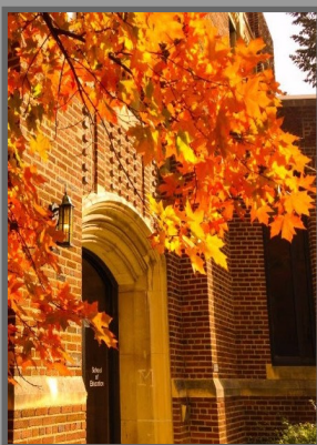
School of Education

The University of Michigan's strategic plan for diversity, equity and inclusion outlines a commitment of $85 million in new resources over the next five years to initiatives that will create an inclusive and equitable campus; recruit, retain and develop a diverse university community; and support innovation and inclusive scholarship and teaching"