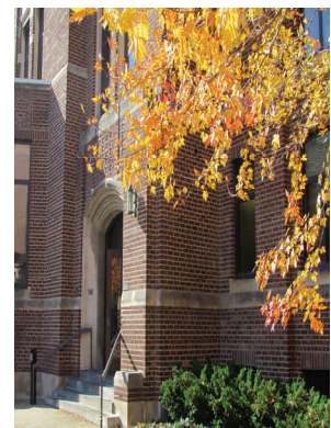
School of Education