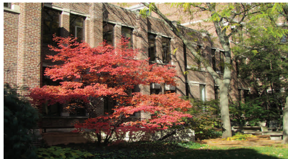
School of Education