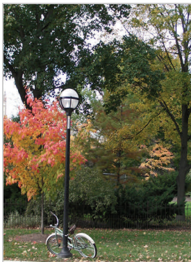
School of Education