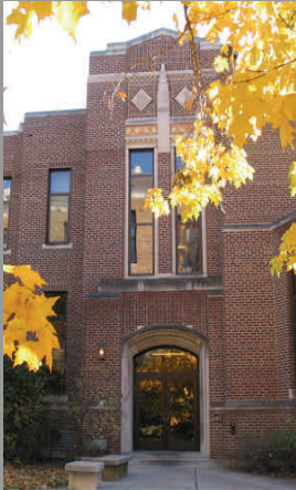
School of Education

Hail! to the victors valiant Hail! to the conqu'ring heroes Hail! Hail! to Michigan, the leaders and best Hail! to the victors valiant Hail! to the conqu'ring heroes Hail! Hail! to Michigan, the champions of the West.