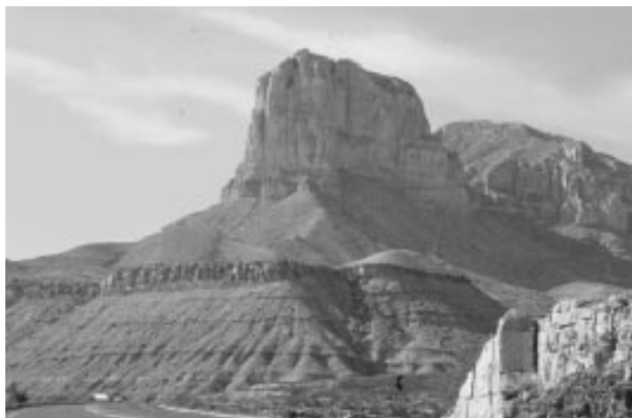
After a long and hot hike through the Permian Reef Complex of New Mexico, students and faculty were blessed with this magnificent view of El Capitan on the southern margin of the Guadalupe Mountains.

regional stratigraphy and tectonics with details of the paleontology and sedimentology, the excursion provided a balanced presentation of geology of the mid-continent region. Some of the geologic features examined during this excursion included: fossiliferous late Ordovician Richmond Group and Silurian reefal carbonates of Indiana and Kentucky; mid-continent Carboniferous cyclothem of Kansas; deformed sedimentary sequences of the Arbuckle Mountains; the classic Permian Reef Complex and Carboniferous shelf sequences of New Mexico; Tertiary extrusives and intrusives of Big Bend region; deformed Paleozoic units in the Marathon and Llano uplifts; and the Cretaceous shelf and reefal carbonates of the Edward Plateau. After long days of travel combined with long hikes into mountains, participants also had the opportunity to discover the diversity of local foods along the journey. Of particular note are Pete's Deluxe Cafe for breakfasts and Lucy's Mexican Restaurant (for multiple dinners) during their stay in Carlsbad, NM. Perhaps future trips should be more properly advertised as the annual Soft Rock Field and Food Trip.