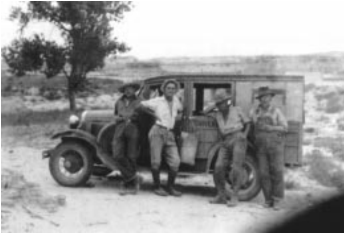
Figure 4. Photo of E.C. Case (rightmost) and three companions, Bobeng, Buettner and White, by their field station wagon in the Big Badlands, 1932. William Buettner was a preparator in the Paleontology Museum. Apparently Case adapted quickly to the automobile and soon developed a reputation for fast driving.

occasion. The article is rounded out with recollections from Case's travels in Africa, including a rhapsodic description of "their" visit to Victoria Falls of the Zambezi. He concluded with "My monument is just a little heap of rubbish but for me it holds the power to evoke memories of a life and a world."